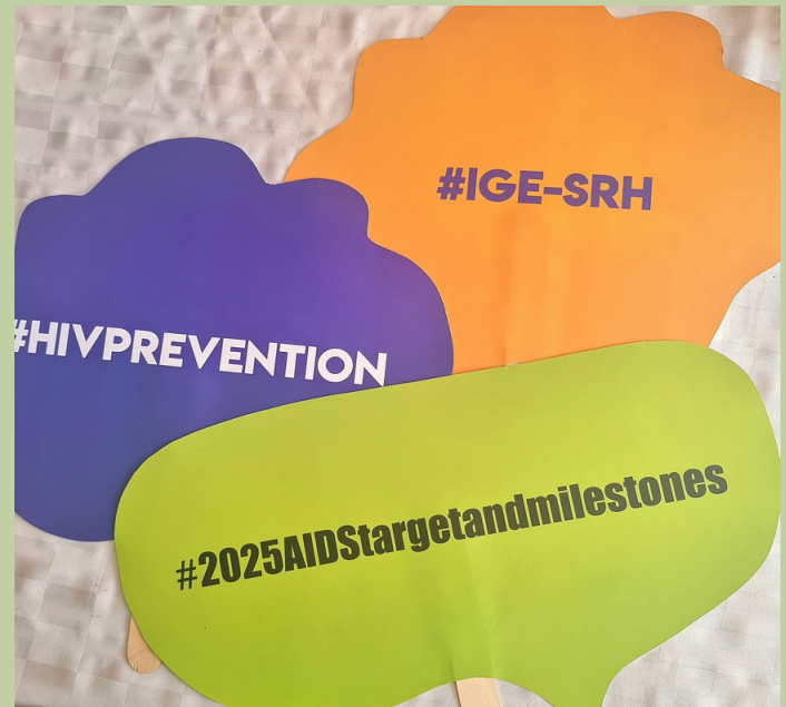
Picture 1.1 Placards

The Initiative for Gender Equality and Sexual Reproductive Health (IGE-SRH) is a sub-national, youth-led organization established to improve the lives of young lesbian, bisexual, queer, transgender, and intersex (LBQTI) rightsholders in Nigeria. Since 2020, we have programmed for our rightsholders through these thematic areas: Health (HIV/AIDs, Mental Health, SRHR, Safe Abortion, STIs/ STDs), Technology for Development, Safety and Security, Economic Empowerment, and Human Rights.